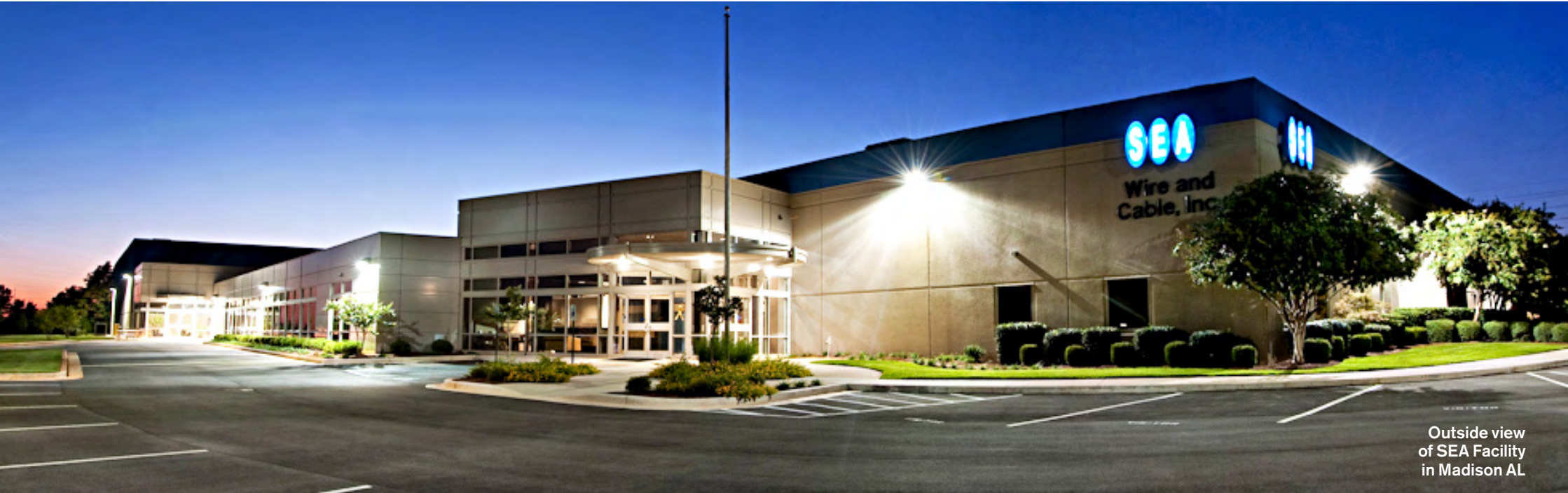
Outside view of SEA Facility in Madison AL