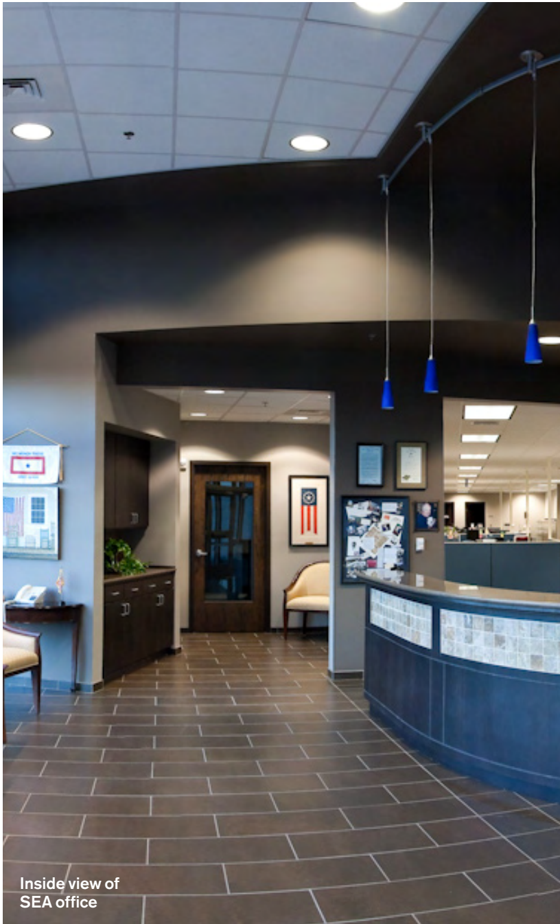
Inside view of SEA office