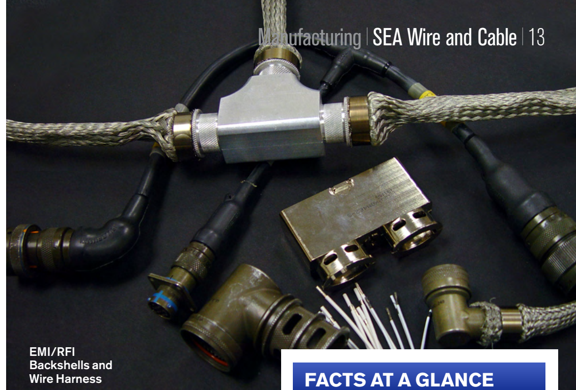
EMI/RFI Backshells and Wire Harness